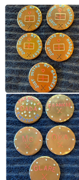
Markers for the whole family