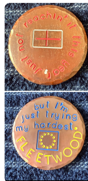
One of Tommy's GLM markers